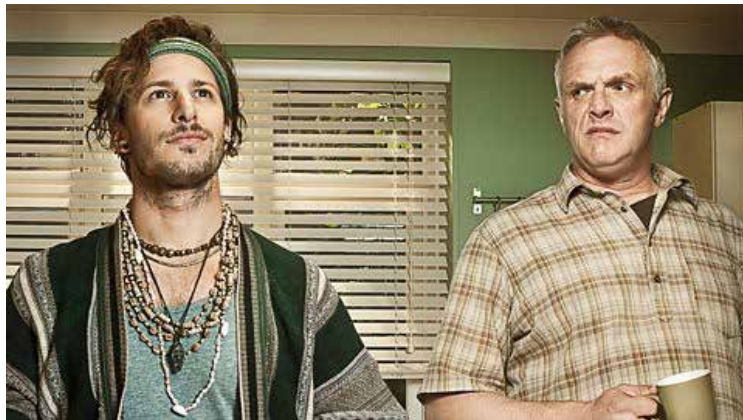
Andy Samberg as Cuckoo and Greg Davies as Ken (from the British tv show Cuckoo)